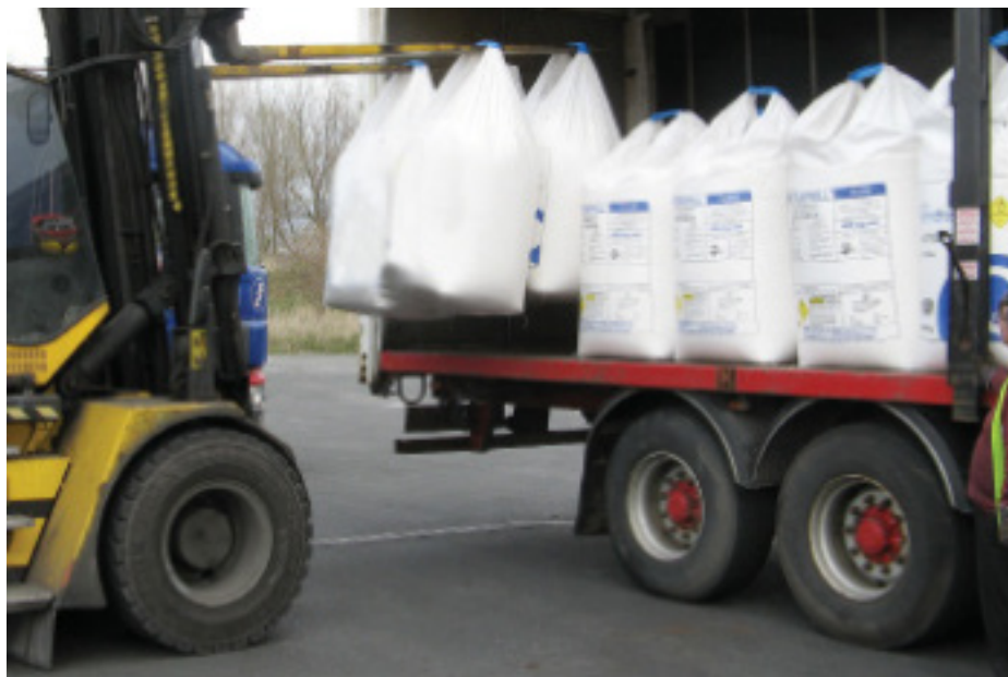
'Loading of IBC's on a road vehicle'