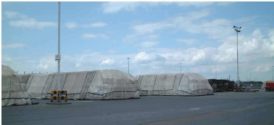
Outdoor sheeted stack

Many of the general principles for the storage of non-classified fertilizers apply just as much to those stored in the open as to those stored in a building. The recommendations made concerning co-storage with other products for inside storage (see Section 10.4) equally apply for outside storage. Special care should be taken to avoid the storage in close proximity to combustible materials such as wooden pallets, gasoline etc. even when separated by a boundary fence. Vehicles should be parked in a designated area at a safe distance from the stored products when not in use.